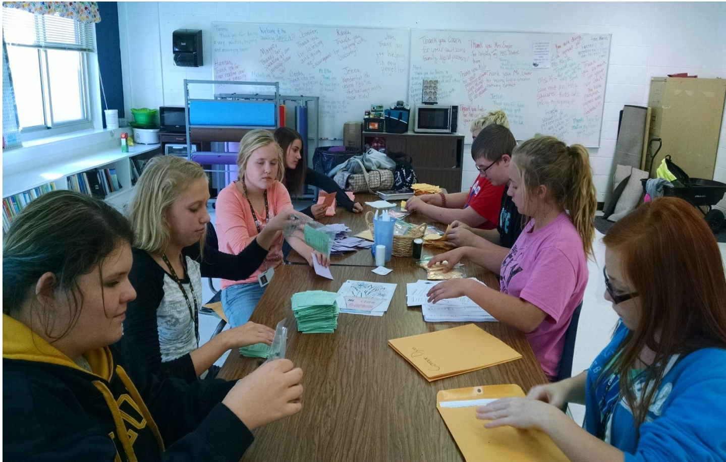
Daily Leadership class