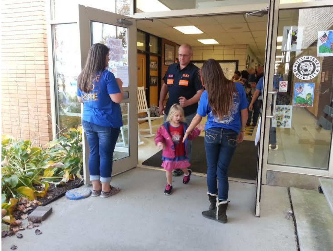
Door greeters for school events